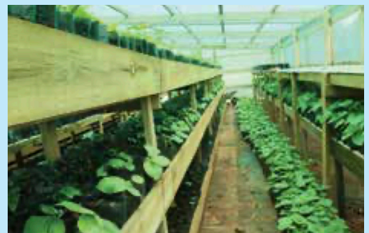
Yaqona plants nurtured at our farming shed in Vaturova, Vanua Levu.