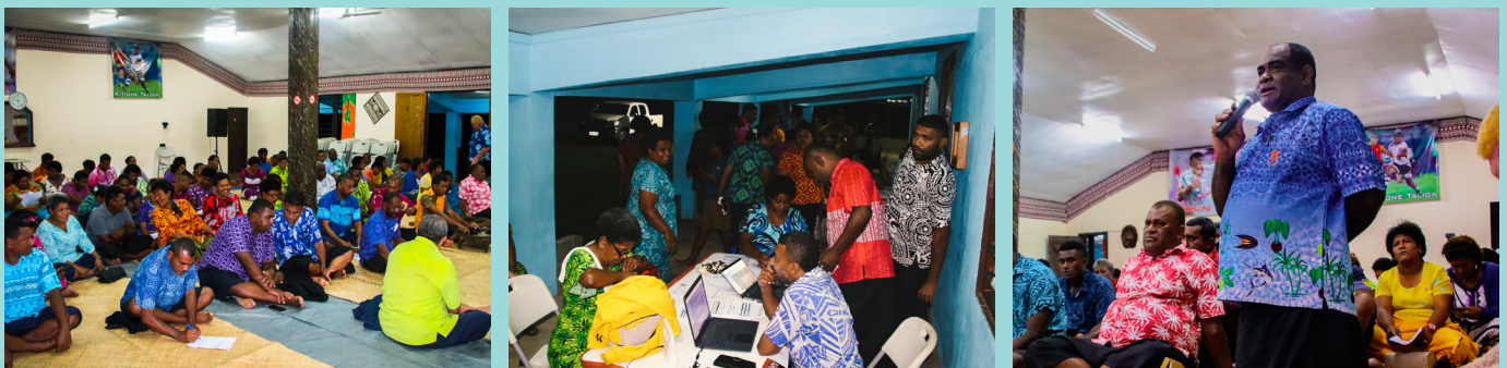
A large number of members from the Western Division turn out during the FTACTL Branch visit at Nadi and to also celebrate the launching of the 'NEW' FTACTL Website.