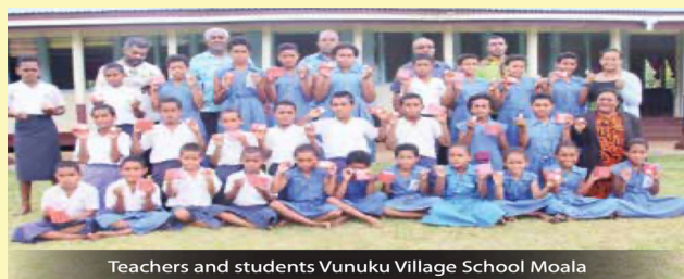
Teachers and students Vunuku Village School Moala