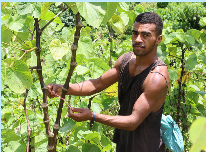
A young man marking out our yaqona plants at the farm site in Vaturova, Vanua Levu on a bright sunny day for data collections.

Experience the True Taste of Fiji - FTA Kava is processed and distributed by FTACTL at Level 2, FTA Education House, 68 Knolly Street, Suva, Fiji. Whether for cultural ceremonies, social gatherings, or personal relaxation, our kava delivers an authentic and rich experience, reflecting the true essence of Fijian heritage.