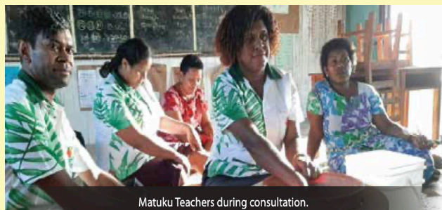
Matuku Teachers during consultation.

and products available with FTACTL especially the new IT System - the Thrift Plus 1 Member Online Portal. They witnessed first hand the ease of services as loan applications were approved from the meeting venues. FTACTL wishes to extend its sincere gratitude to Heads of Schools and Teachers of schools visited for their hospitality.