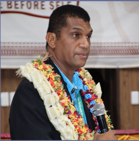
Hon. Aseri Radrodro Minister for Education