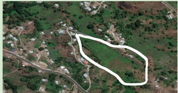
Ariel View : Natabua Native Residential Lease

Uluinatabua, Lautoka in the near future. Once all the necessary steps have been taken to build this village and the knowledge gained, the sales and purchase process for the remaining Villages should become much smoother.